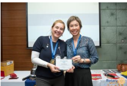
Service Above Self Award