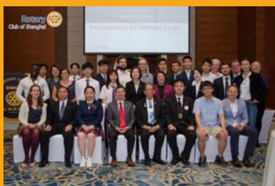
Interact Day ~ May, 22nd 2018