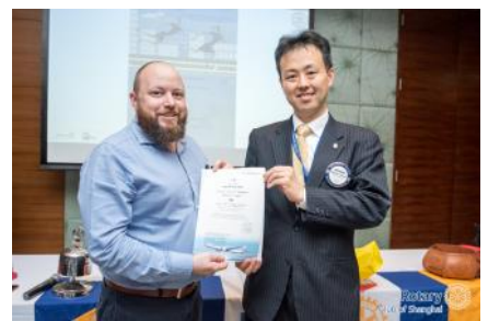
The Big Winner