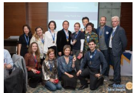
The Dream Team